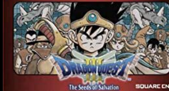
Physical DQ Bundle: 49.99